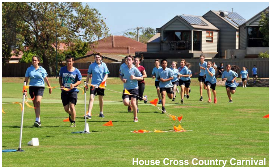
House Cross Country Carnival