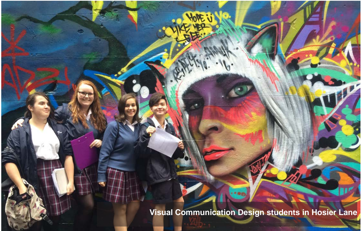
Visual Communication Design students in Hosier Lane

In the first week of Term 2, VCE Visual Communication Design students attended an excursion that gave them the opportunity to view folios and final designs produced by the state's top VCE students in 2015, as well as attend an educational forum. Students were offered an understanding of the design process and folio creation, and provided with inspiration for their own work.