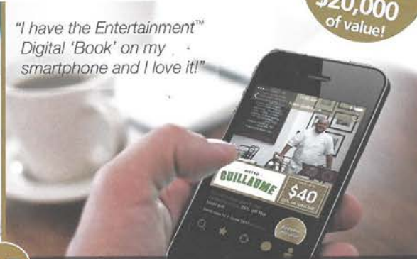
The entertainment Digital Membership

"I have the Entertainment™ Digital 'Book' on my smartphone and I love it!"