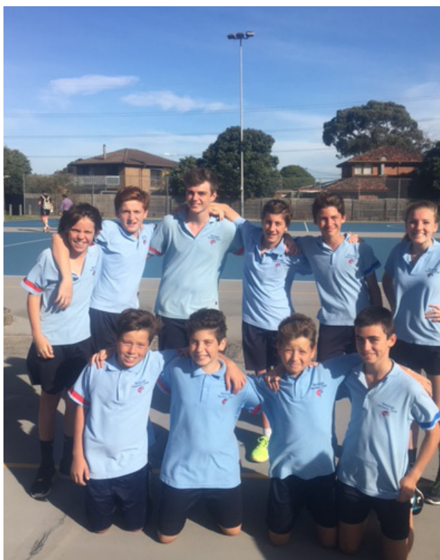
JUNIOR BOYS NETBALL